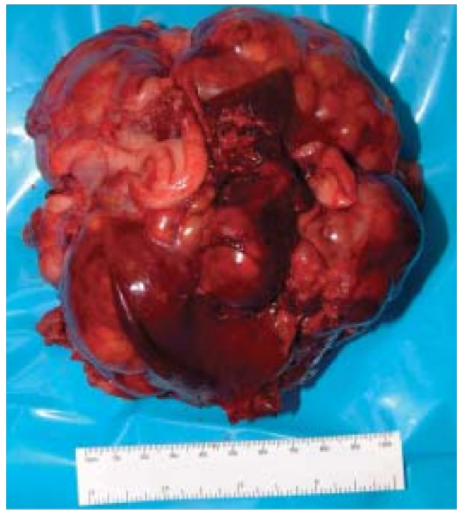
Figure 2. The massive hepatocellular carcinoma in Figure 1 following surgical resection.

Abdominal ultrasonography is the preferred method for identifying and characterizing hepatobiliary tumors in cats and dogs.<sup>18,31–35</sup> Sonographic examination is useful in determining the presence of a hepatic mass and for defining the tumor as cystic or solid, and massive, nodular, or diffuse.<sup>18,31–35</sup> If focal, the size and location of the mass, and its relationship with adjacent anatomic structures, such as the gallbladder or caudal vena cava, can be assessed.<sup>18,31–35</sup> Furthermore, tumor vascularization can be determined using Doppler imaging techniques.<sup>4</sup> The ultrasonographic appearance of hepatobiliary tumors varies and does not correlate with histologic tumor type.<sup>18,31–35</sup>